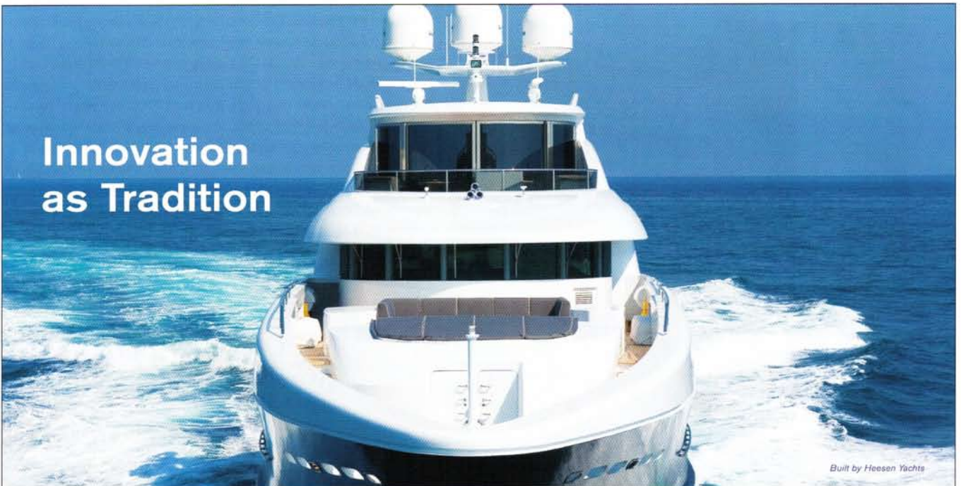
Built by Heesen Yachts

RAFA is an efficient and dynamic organisation specialising in glazing and the production of top quality aluminium and brass window frames fitted with all kind of glazing. All windows are custom-made and are developed in close cooperation with the principals and