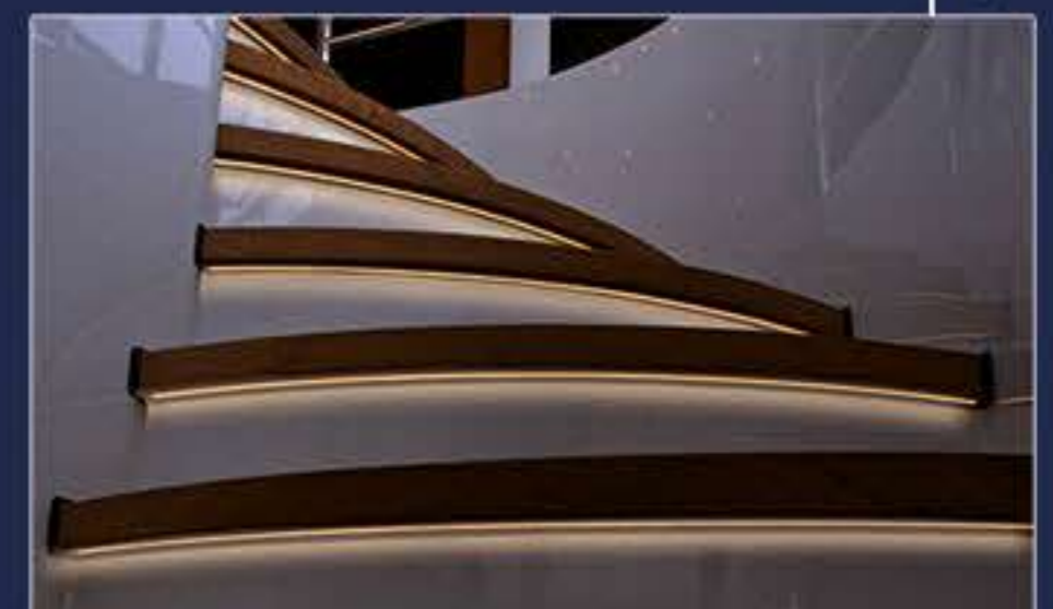
Individual stair illumination