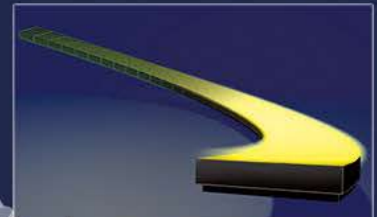
3D formed furniture illumination