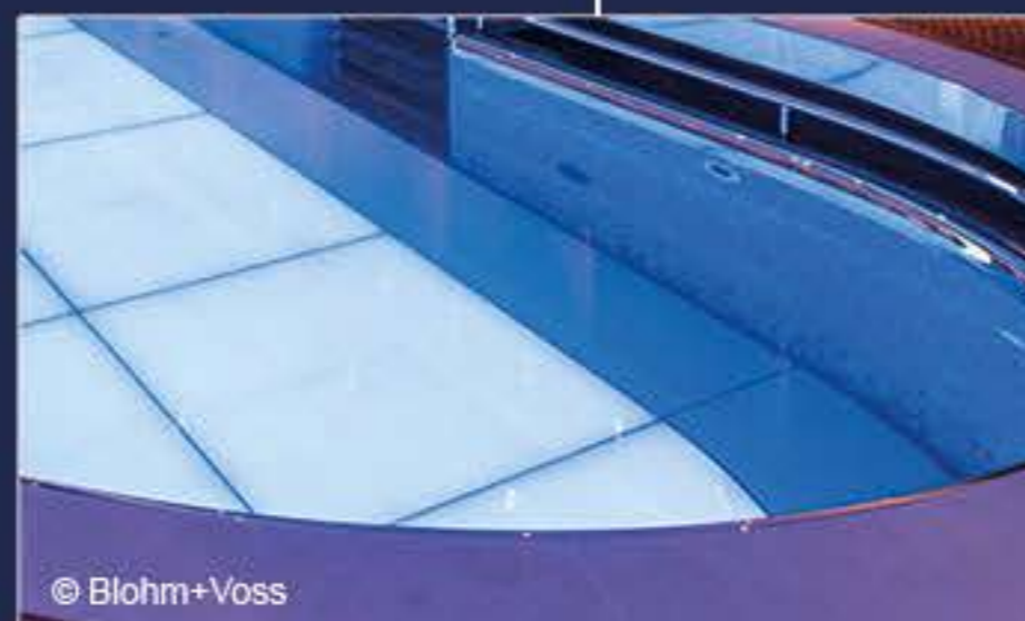
Illuminated pool flooring