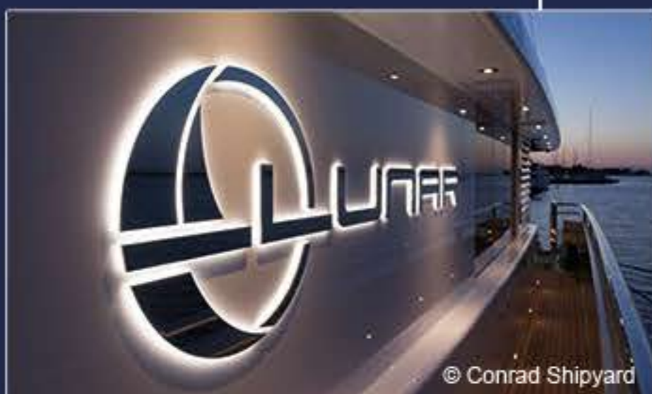
Letterings & logos